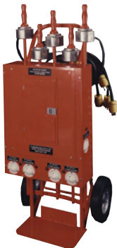
Portable Distribution Center