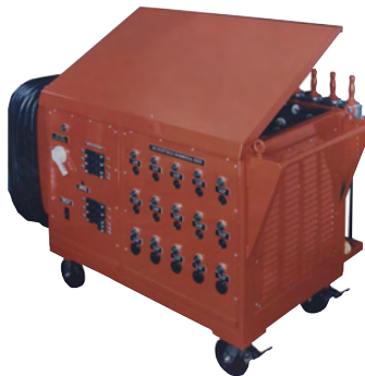
The "Outage Master" Distribution Center