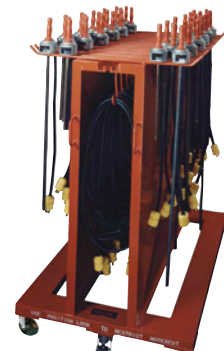
Bolt Heater Storage Cart