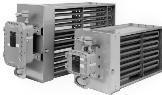
Figure 85. Series EP2 Explosion-proof Duct Heaters